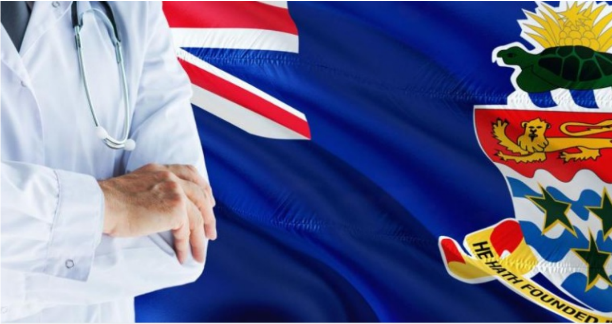
How A Little Island In The Caribbean Sea Is Standing Up To The Goliath Of Coronavirus forbes.com

CAYMAN ISLANDS HEALTH SERVICES AUTHORITY (HSA)